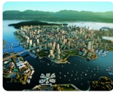
Vancouver, British Columbia